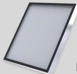
MEGAcel® II with eFRM Filtration Technology