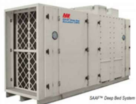
Fig. DBS (Deep Bed Scrubbers)

For its Delhi facility, AAF proposed RU (Recirculation Unit), a stand-alone complete air purification system. It recirculates and cleans the air in a controlled environment. This RU unit has placed in multiple numbers in multiple blocks of the data centre to protect from air pollution.