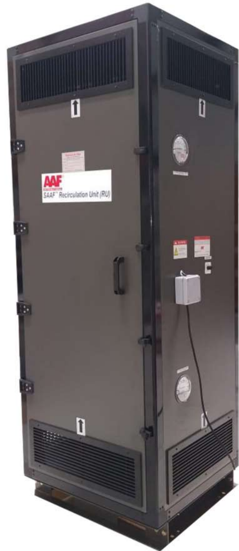
Fig. RU Unit

AAF provided customized engineering solution - DBS for its first facility to fight corrosion. The customer was happy with the TCO and the service. Hence, the customer placed orders for all the new facilities. AAF offered customized DBS filters for 5 cities, and RU for Delhi. With the strong network and service across India, AAF won 6 cities project from leading data centre provider.